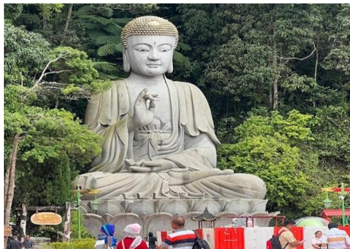
Figure 3. Statue of Chinese Spiritual Tradition Belief

Field survey results and spatial analysis using Google Earth Pro show that the Chin Swee Caves Temple cultural tourism area has well-defined territorial boundaries. The digitization and delineation process produced an area of approximately 28 hectares. This area functions as a place of worship that later developed into a cultural and spiritual tourism destination. The existence of Chin Swee Caves Temple serves as an important marker in the spatial structure of tourism in Genting Highlands, reflecting the relationship between the mountainous landscape and the religious practices of the Chinese community.