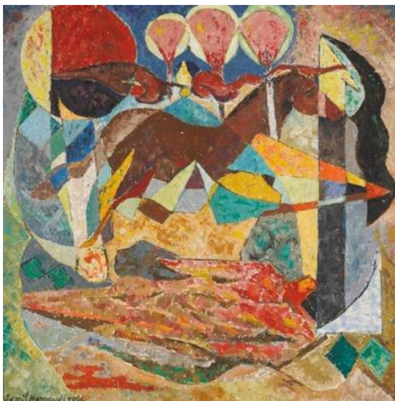
Figure 10. Painting by the Artist Jamil Hamoudi

This is work that fits in with some of the artistic movements of the 1980s, part of the way of integrating text with image. Contemporary influences of Arabic calligraphy can be seen alongside European Surrealism, and while Hamoudi interprets these influences in a local cultural language, he is building a uniquely personal artistic idiom. Since the title is named after him, it could also be seen as a nod to self-referentiality, one of the aspects of the artist, an intermediary between reality and the subconscious. This painting dissolves the boundaries between writing and image, creating a transdisciplinary space where "light" becomes a physical experience as much as an abstract concept. Hamoudi, in creating an artwork tastefully fusing Eastern and Western symbols and culture, produces a piece that references its heritage while also serving as a global participant and interlocutor in contemporary visual art discourse. This distance from traditional frameworks and reliance on informal epistemology situated this work as an early example of what we can call grounded Surrealism in modern Arab art.