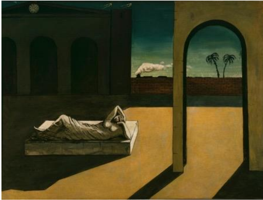
Figure 5. Giorgio de Chirico, "The Fortune Teller's Reward," 1913, oil on canvas, 135.6 x 180 cm (Philadelphia Museum of Art)