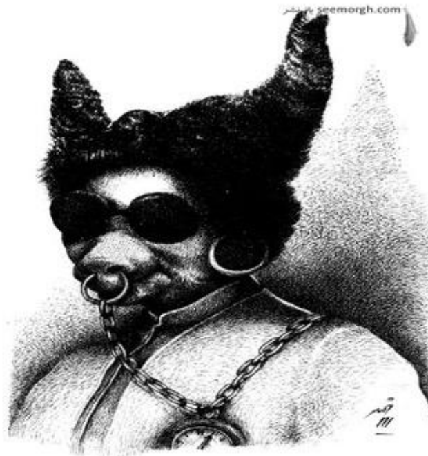
Figure 6. Painting by the Artist Aminullah Rezaei