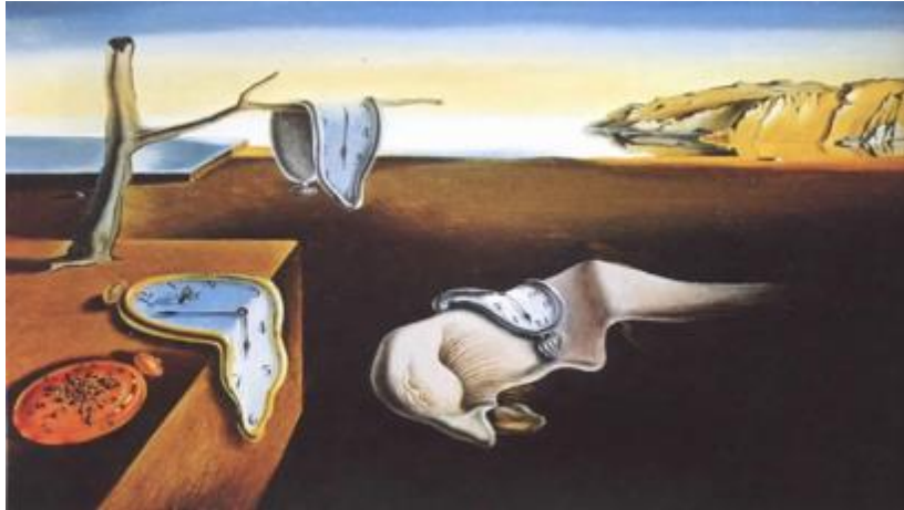
Figure 1. Dali's Works

Surrealist painting can be categorised into two primary types: the first, which Salvador Dalí referred to as "hand-drawn dream objects," depends on conventional methods such as realistic photography to portray a disturbed, fantastical, and surreal realm. In these works, imaginary scenes are depicted, juxtaposing disparate objects, dissected components of items synthesised into unusual and innovative phenomena, as well as machines and industrial structures, monstrous creatures, organic-abstract forms, and distorted images of this nature, similar to Dalí's works.