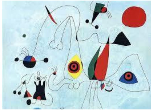
Figure 3. Miró's Works

The same principle pertains to the artistic endeavours of Mason. This category of surrealist artists occasionally employs automatic methods utilising techniques such as collage, transfer, etching, printing, and others. The outcome is often an abstract composition that approaches abstraction (Pakbaz, 2004).