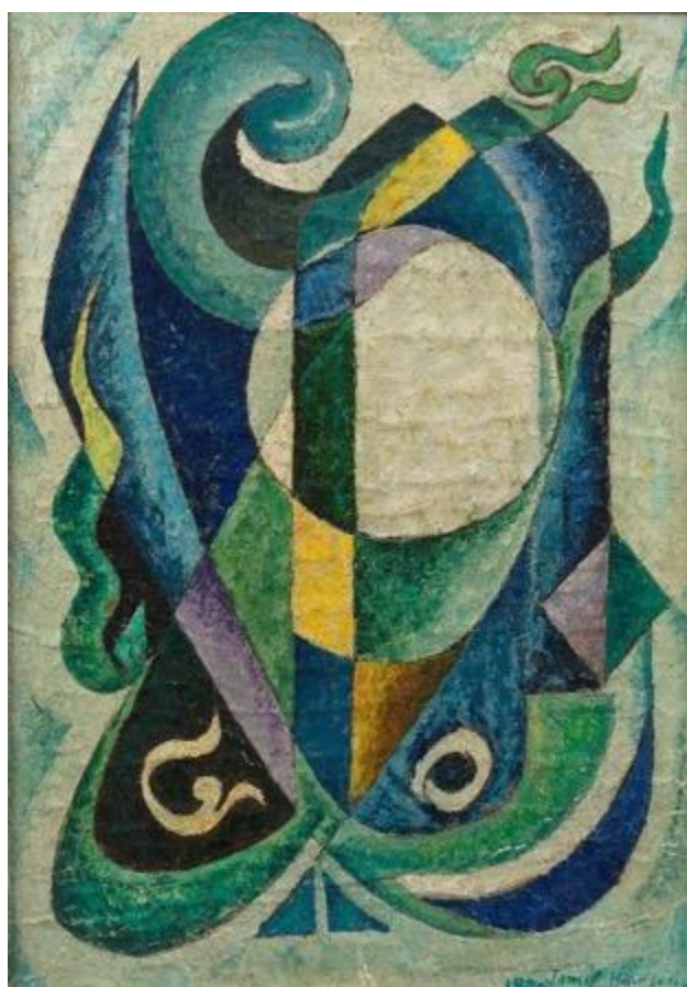
Figure 9. Painting by the Artist Jamil Hamoudi

Surrealistically, this painting can be seen as an example of "visual automatic writing," which transcends the legal, legible border between image, sign, and meaning. In contrast to the Euro-colonial tradition of Surrealism, which uses dreams, fantasy, and Freudian suggestion, Jamil Hamoudi brings Surrealism into the Islamic Sufi tradition, where the unconscious is considered a vessel for channelling the divine and the Other. In this light, this work can be regarded as a kind of sacred Surrealist mythopoetics, wherein the holy word is materialised as a subject of revelation and testimony rather than recitation.