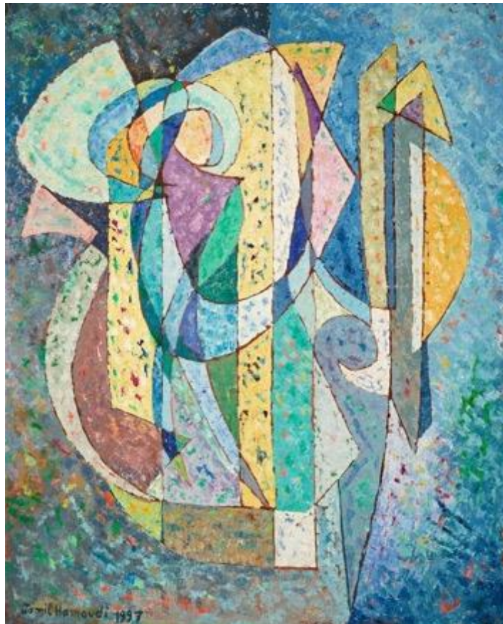
Figure 8. Painting by the Artist Jamil Hamoudi

In this major painting of 1997, Jamil Hamoudi uses surrealist forms and the calligraphy tradition to express the word 'Allah' in an abstract, geometric, multilayered manner. Hamoudi defies the traditional objectives of Arabic calligraphy and endows letters with visual significance, so that at first they are hard to recognise as letters. More than just writing the words of a sacred text, this painting attempts to reproduce the experience of an intuitive and psychological confrontation with the divine name "Allah". These letters are not meant to be read but rather seen, felt, and understood in a non-linear, non-verbal way.