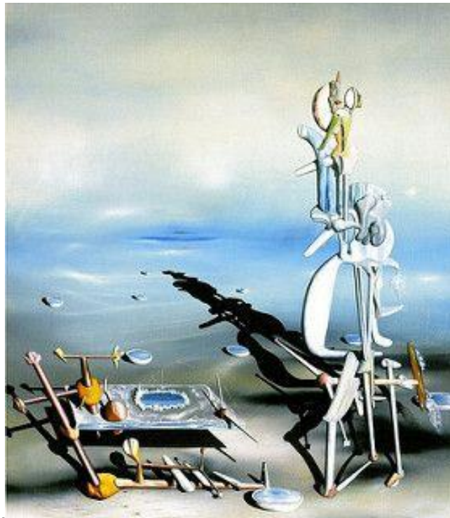
Figure 2. Tangi's Works

And also in the works of (Tangi), as in the figure below